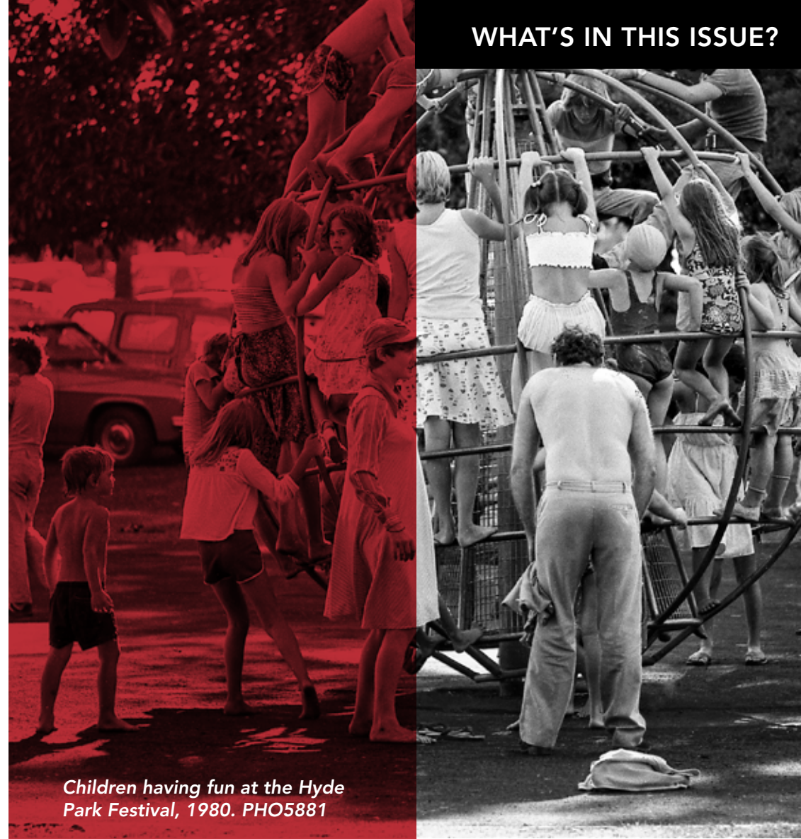
Children having fun at the Hyde Park Festival, 1980.