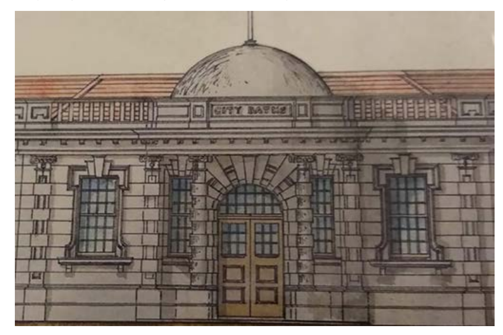
Plan of swimming baths proposed to be erected at Hyde Park, 1912. SRO WA S4123 Cons1644 050.