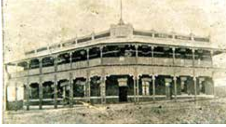
The Rosemount Hotel circa 1910. PH04196

A Licencing Court application was published in The West Australian on 5 March 1902 for a building certificate for Alfred Dowell, owner of the site of location 653 Lot 11. Three weeks after the application was made, approval was given to construct a new hotel at the corner of Angove and Fitzgerald Streets, North Perth. The architect was Charles Oldham who described the building as, "first class with 27 rooms of which 13 were bedrooms."