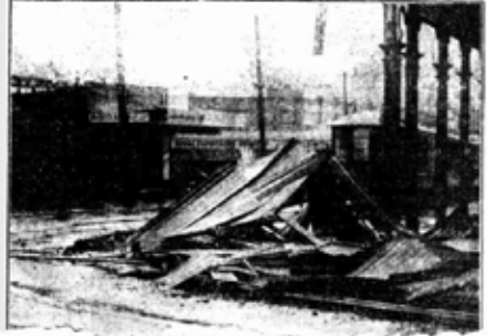
Right on the hill the Rosemount Hotel at North Perth got in the way of the wind last evening and lost its verandah.