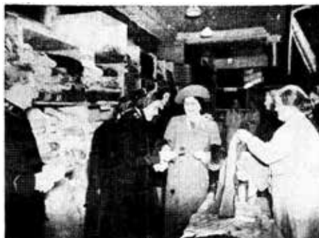
Australia Delivers the Goods . . . this picture was sent by Salvation Army headquarters in London to the Child War Victims Fund in Perth. It shows a recent consignment of clothing from Perth being inspected by Her Majesty the Queen.

CLOTHES REACH BRITAIN. Prisoners of War Get Parcels . . . More Women in War Work . . . Lifeboat Adventure.