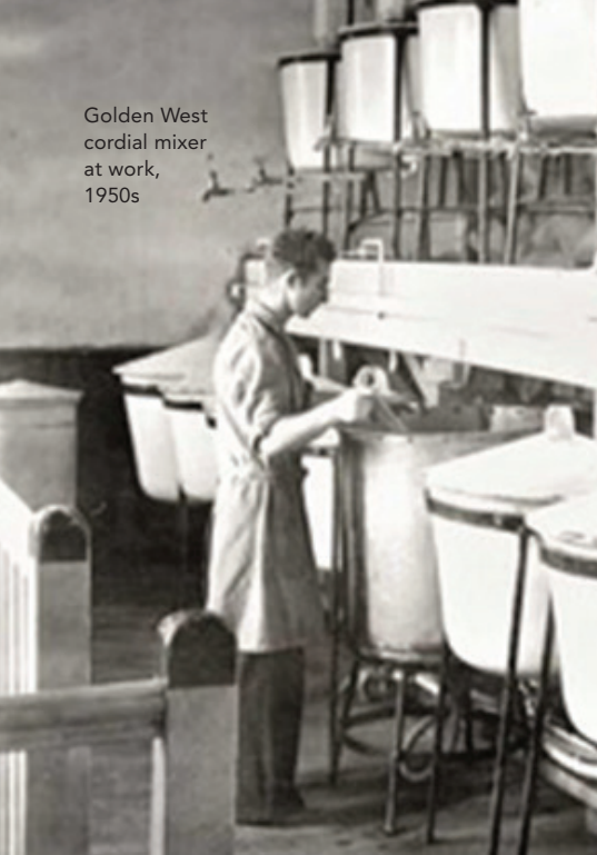
Golden West cordial mixer at work, 1950s