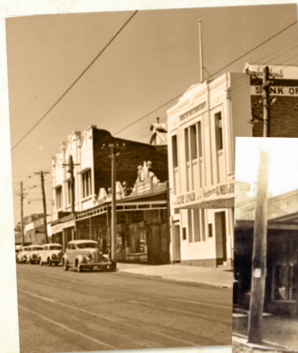
Looking north along Fitzgerald St from Wasley St, 1940s