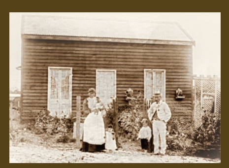
TOV Local History Collection PH01412 courtesy Marj Cook