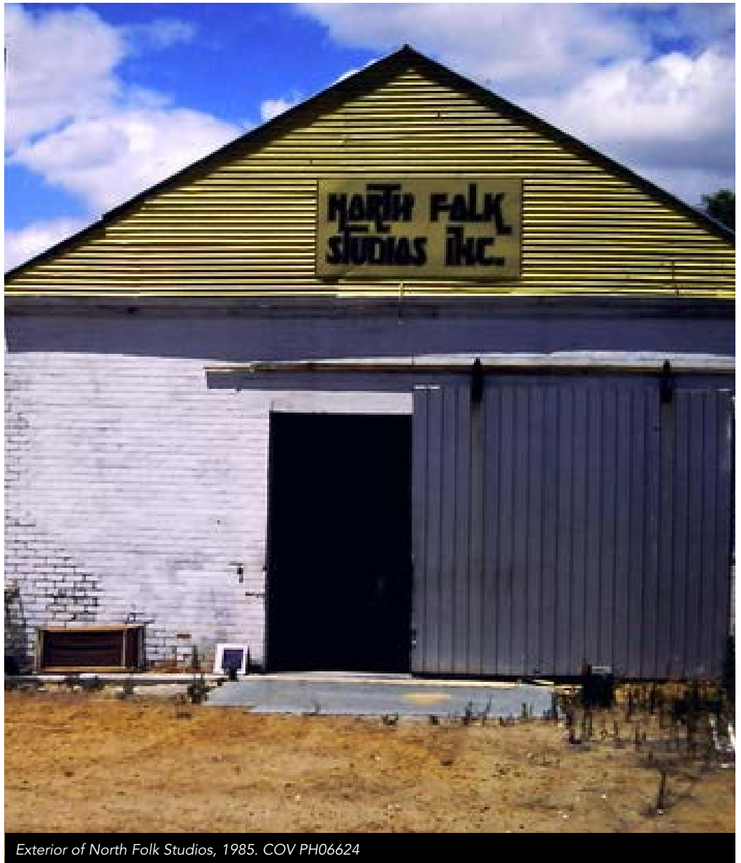
Exterior of North Folk Studios, 1985. COV PH06624