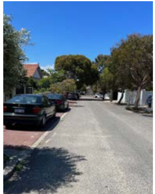
Janet Street, West Perth, Looking Towards Charles Street, 2023. COV PH06635