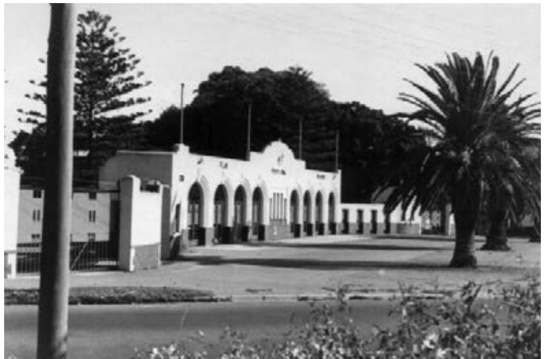
Gates at Perth Oval, 1960s. COV PH01328