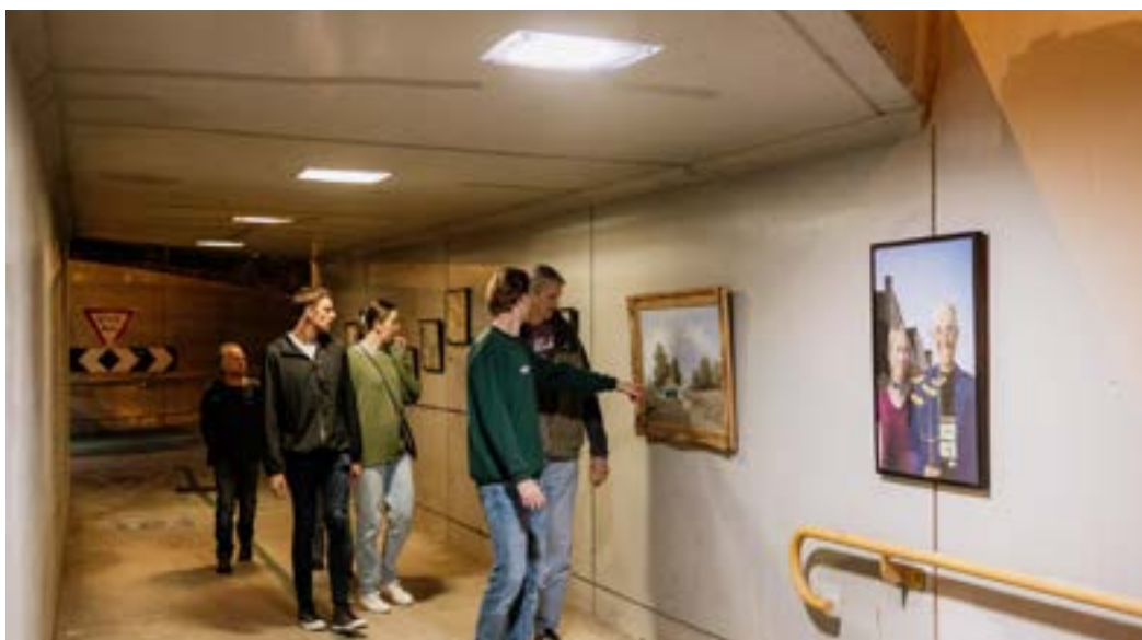
The Pickle District After Dark 4.0 Art Crawl Entering the Bicycle Subway Old Aberdeen Place, Perth, 2023. COV PH06683