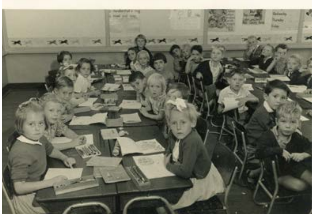
Year 1 Class at North Perth Primary School, 1957.