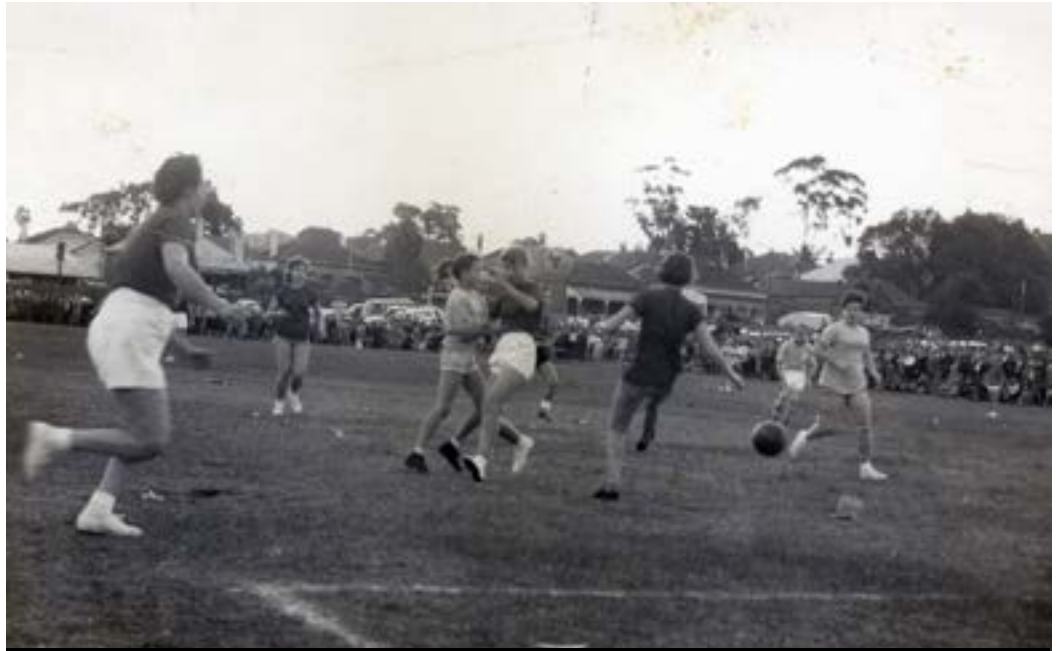
Azzurri women's soccer team at Dorrien Gardens, 1959.