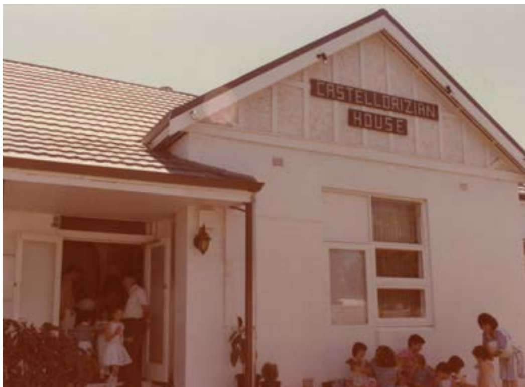
The Opening of Castellorizian (Cazzie) House, 160 Anzac Road Mount Hawthorn, 10th December 1981. COV PH06651