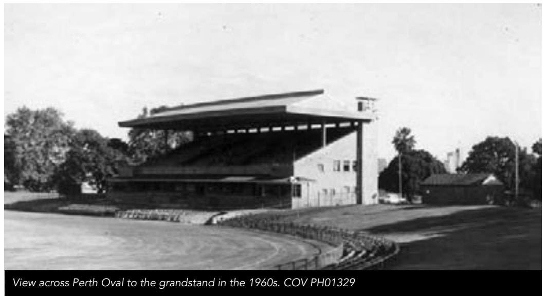
View across Perth Oval to the grandstand in the 1960s. COV PH01329