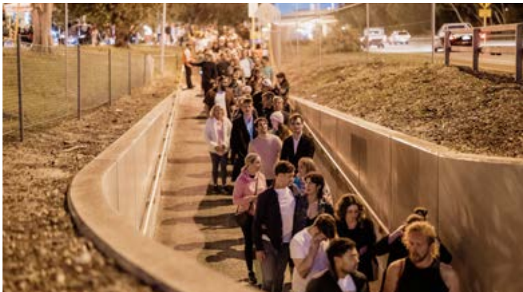
After Dark Art Gallery. The Pickle District, Bicycle Subway Perth, September 2023. COV PH06680