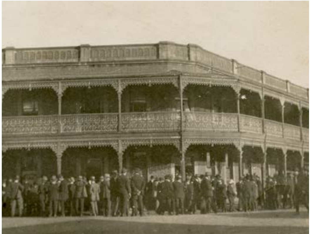
Norwood Hotel at 282 Lord Street, East Perth, 1922. COV PH06571