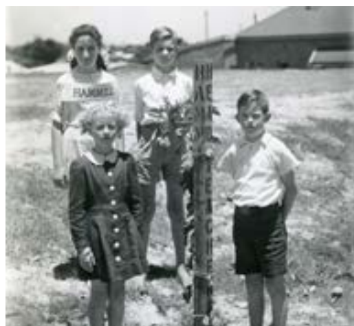
Goonderup Day celebrations at North Perth Primary School, 1940s. COV PH06669-PH06673