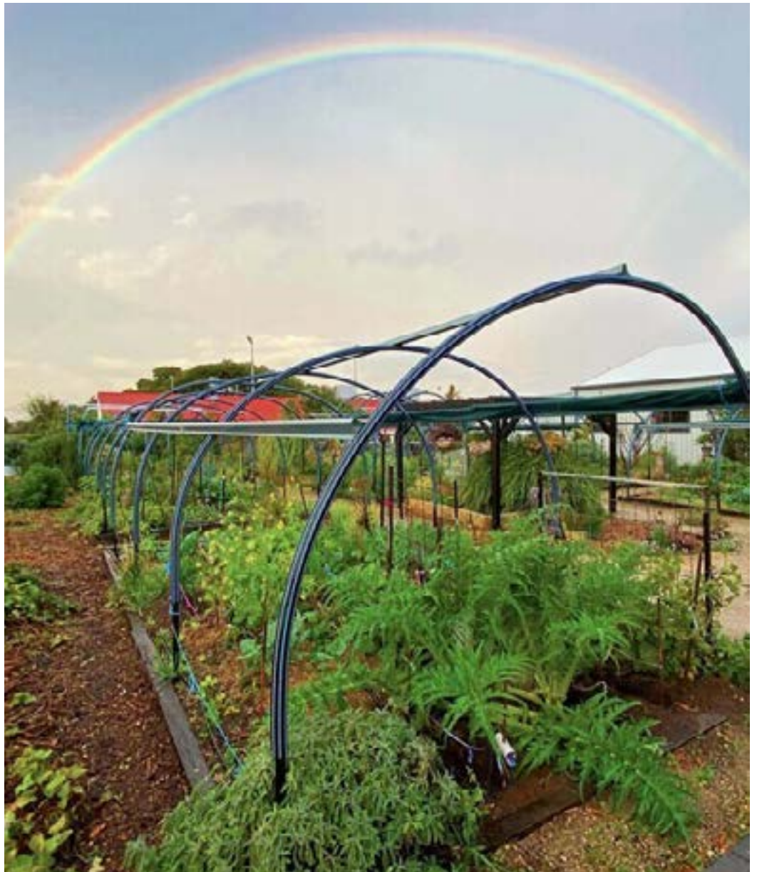
North Perth Community Garden, 2021. COV PH06508