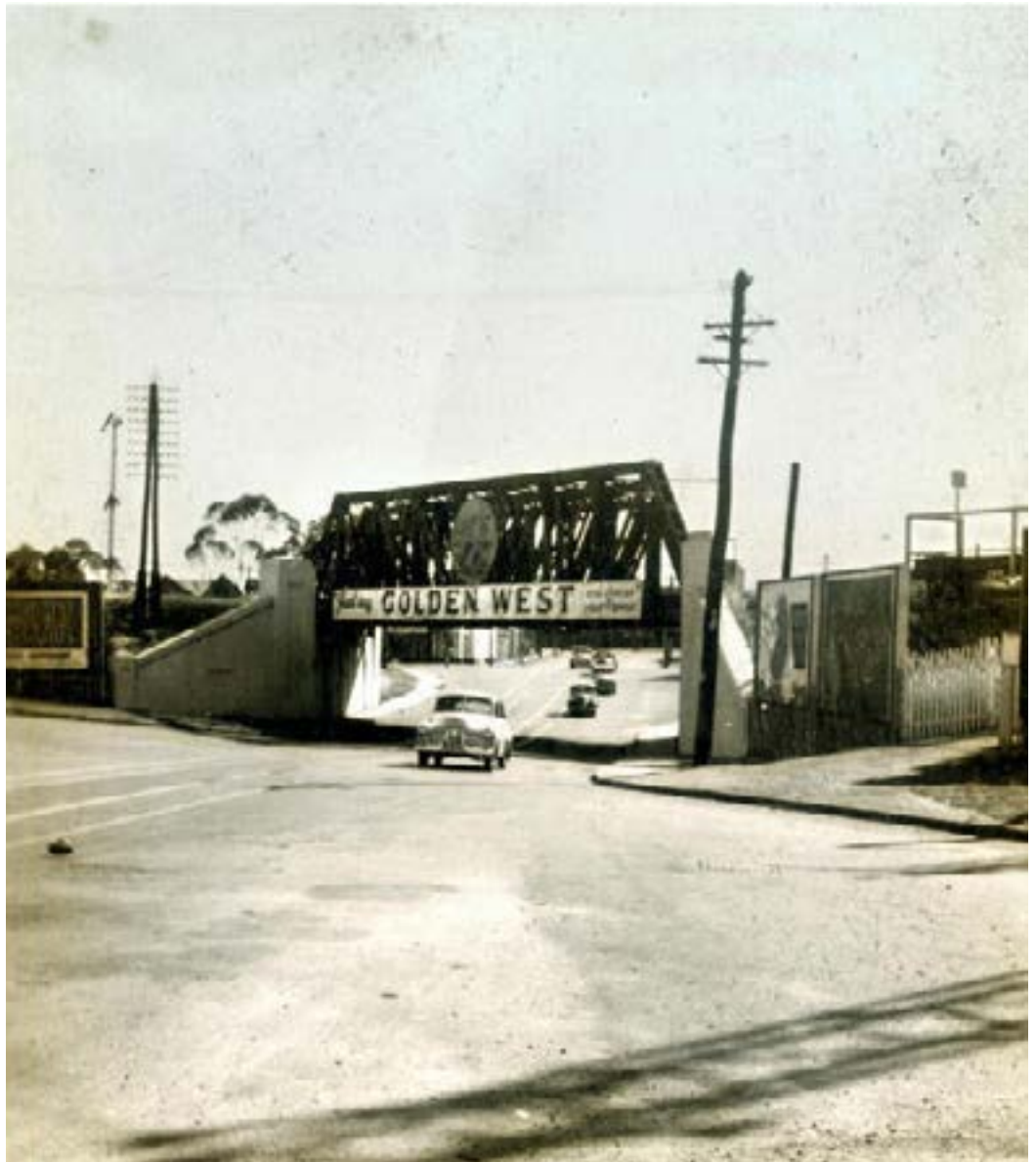
Cars driving on Guildford Road under the Mount Lawley Subway, travelling south towards the city, 1954. COV PH04226